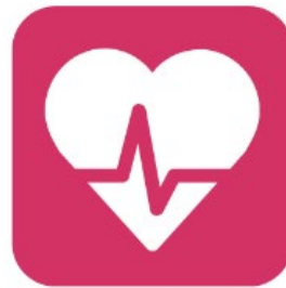
Health & Wellbeing