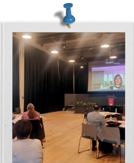
Staffs CAN 03/10/23